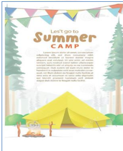
(Page-2 of the invitation card must be written in English)