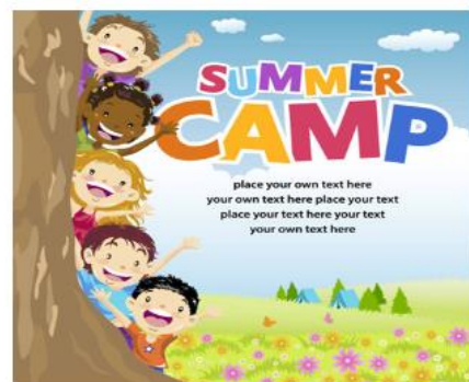
(Page-3 of the invitation card must be written in 2nd language)